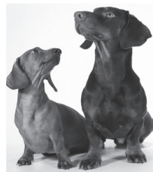
Miniature & Standard Dachshund

According to the standard, "The Dachshund is low to the ground, long in body and short of leg with robust muscles and elastic, pliable skin." The Dachshund is bred in two sizes, which are defined by weight. The standard Dachshund ranges in weight from 16-32 lb. and the miniature Dachshund weighs 11 lb. and under. In addition, they are bred in three coat varieties, the smooth (short hair), the long hair (long, silky coat) and the wire (a dense, wiry coat). His small to medium size makes him particularly suited for small yards and apartment living.