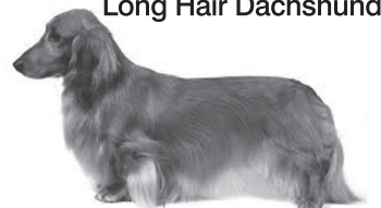
Long Hair Dachshund